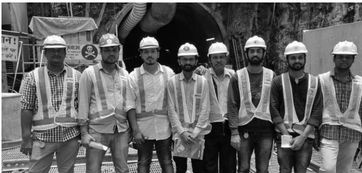
MIT Students at MMRC Work site, July 2019

In cooperation with HCC-MMS JV organized a site visit at the ongoing work site on 12th July 2019 at UGC-02 of Mumbai Metro Line-3. The visit focused on "TBM Working and Operations".