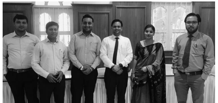
TAIym @ MIT Pune in June 2019