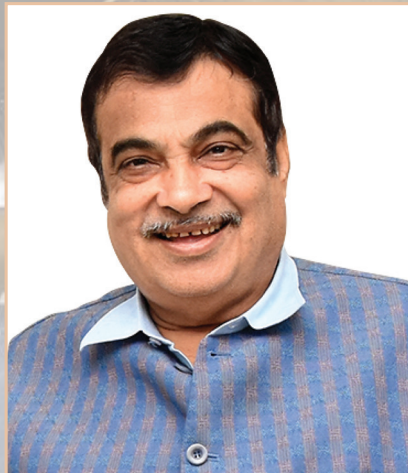
Shri Nitin Gadkari Hon'ble Minister of Road Transport & Highways, Govt of India